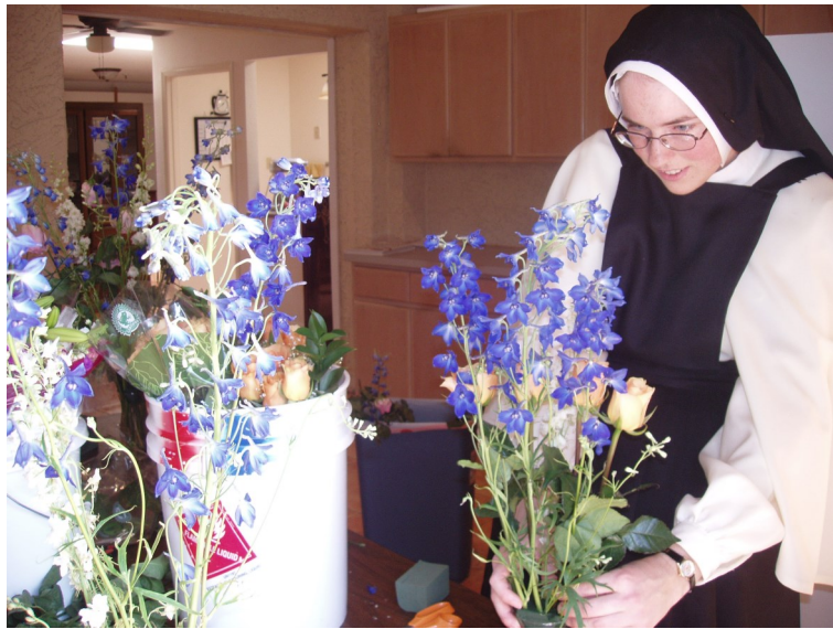
A postulant arranges flowers for Our Lady's altar.